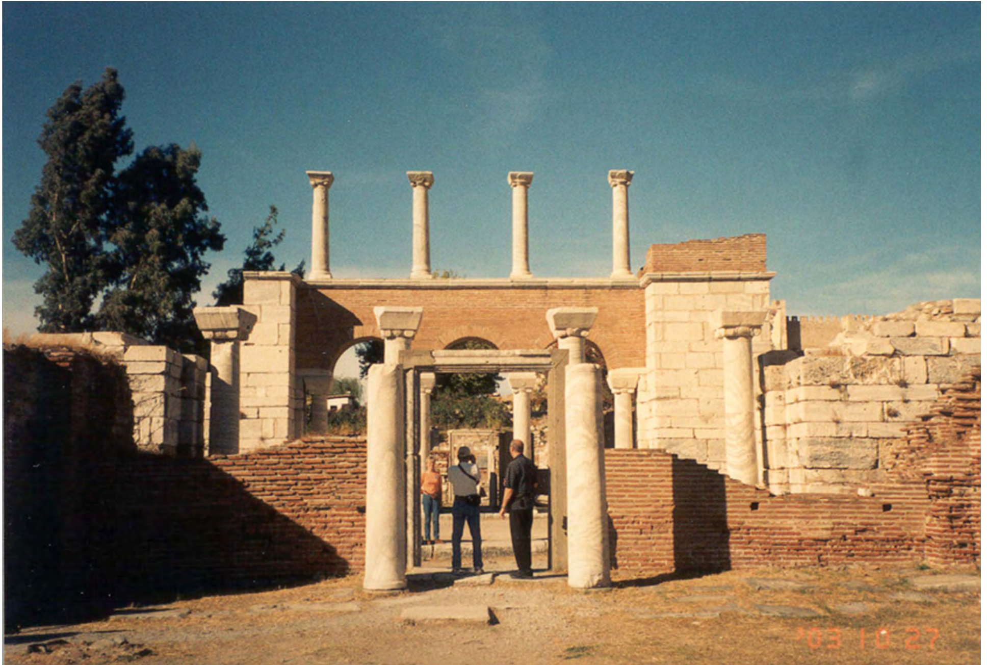
Church of St. John in Ephesus, where John is buried.