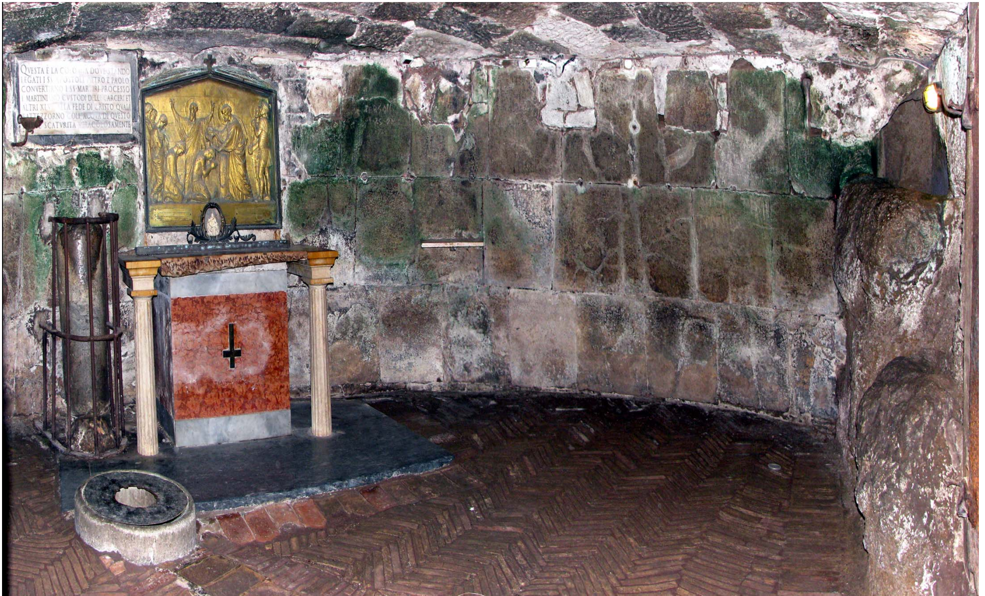
The Mamertine Prison in Rome where Peter and Paul were held till they were martyred by Nero's edict.